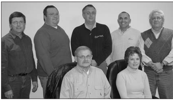
Nominating committee meets to select director candidates.